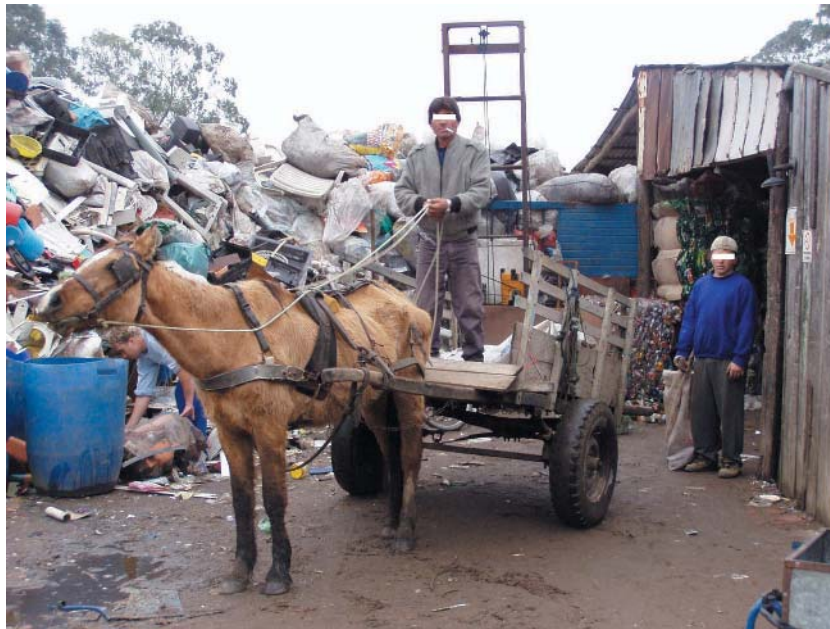
Figure 3 A ragpicker, on his horse-drawn cart. He has brought material to a collection point, where a middle man will weigh his material, and pay him cash for it.

rate. Sometimes, they may be paid in food products in addition to cash.