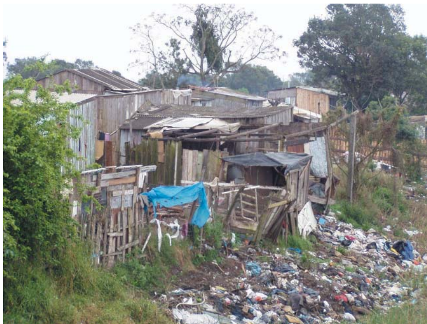
Figure 1 Houses of ragpickers are often of very poor condition. They bring garbage back to the house to separate it, and there are often piles of non-recyclable waste dumped nearby.

Almost half (47%) of the ragpickers were non-white, compared to 32% of non-ragpickers, and only 15% of the Pelotas general population. Although we attempted to match non-ragpickers to ragpickers to within one year of schooling, the differences were so marked that our samples retained some striking differences in education. Fully 22% of ragpickers had not completed a single year of schooling, while only 12% of the non-ragpicker sample had no schooling. In the general population sample, only 1% reported less than one year of schooling (table 1).